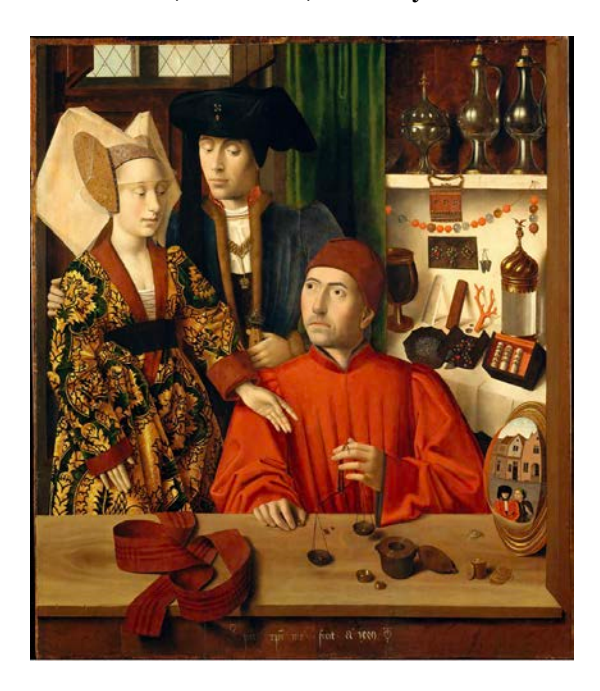
Petrus Christus, A Goldsmith in his Shop , 1449, Oil on oak panel, painted surface 38 5/8 x 33 1/2 in. (98 x 85.2 cm)

So pictures of merchants have often contained much more than simple images of commerce and the convex mirror was a way to include additional information. In addition, these paintings were opportunities for the display of a painter's command of technologies-an opportunity to demonstrate how well they could replicate the world. Jan Van Eyck's Arnolfini Wedding Portrait (painted in 1434 and housed at the National Gallery in London) does all of this and in addition shows the painter as witness . All of the attention to detail and relentless focus are present through out the picture but the end here is much more than simple depiction. As Erwin Panofsky and others have posited, the painting of a wedding also doubles as the contract for the union<sup>3</sup>. So the painter here is witness to the marriage and legitimizes it with the