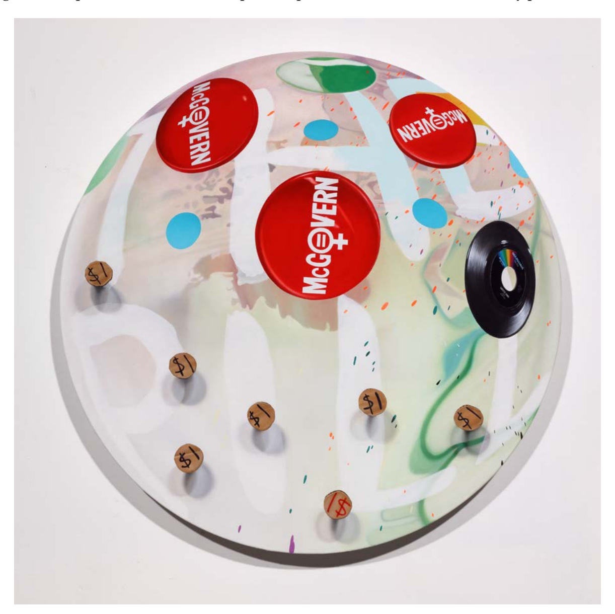
Craig Drennen, (The Pill), oil & alkyd on canvas over panel, 72-inch diameter, 2022

about the power to make a certain kind of intimate decision-and the economic liberation that goes along with that power. An economic and political power that started to be courted by political actors.