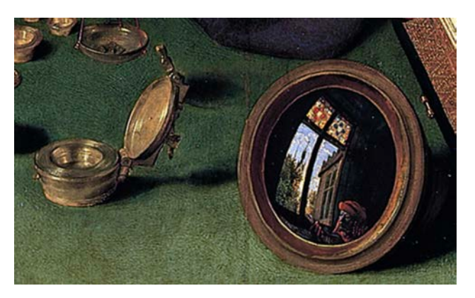
Detail The Money Changer and His Wife showing the image of the "Debtor" and the surrounding environment.

coins. Moreover, there is a profound attention to spherical illusion in these paintings that make them more than simply circular, they appear to be convex . This attention to illusion combined with the silvery cool palette brings to mind the mirror . And historically, convex mirrors have appeared in Netherlandish paintings that deal specifically with commerce and exchange.