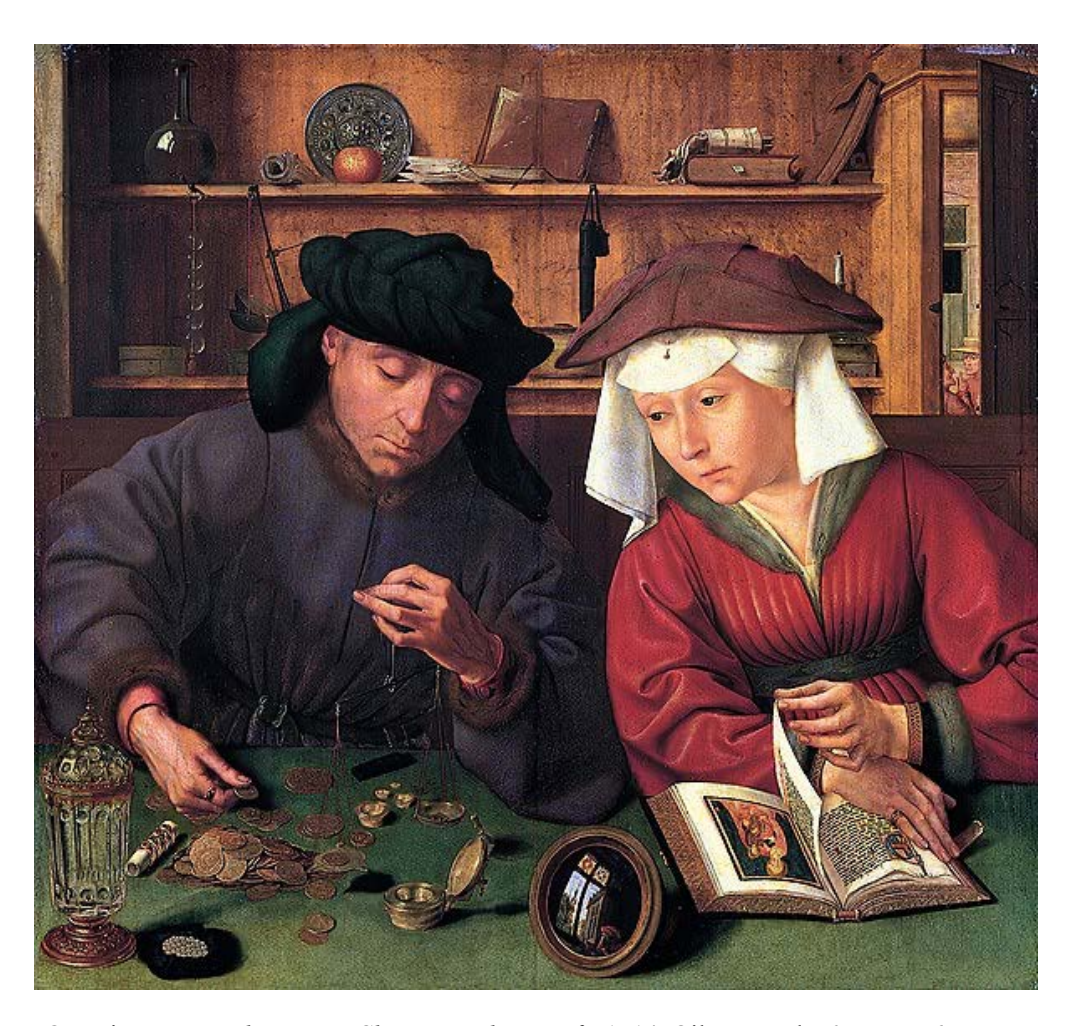
Quentin Matsys, The Money Changer and His Wife , 1514, Oil on panel, 70.5~\text{cm}\times67~\text{cm} (27.8 in \times 26 in), Louvre, Paris

I'll be your mirror Reflect what you are, in case you don't know I'll be the wind, the rain and the sunset The light on your door to show that you're home<sup>1</sup>